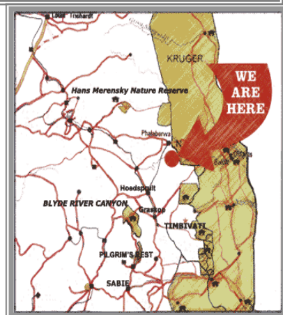
For enlargement of maps, please contact the hotel

Turn of to Belfast Take the R540 to Dullstroom and Lydenburg. Take the R36 to Ohrigstad through the Strydom Tunnel and Abell Erasmus Pass on the R527. Turn left on to the Tzaneen/Phalaborwa road. Continue for 11kms. Then turn right on to the Phalaborwa road. Go over the Namakgale 4-way crossing and turn right into Hendrik van Eck Drive. Turn right into Lekkerbreek Road and turn right into Essenhout street. The Hotel will be on the right - approximately 100m onwards.