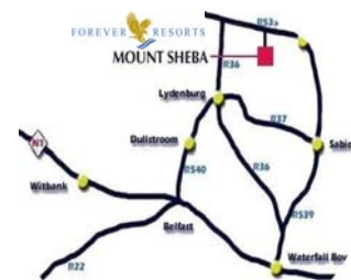
For enlargement of map, please contact the resort

From Gauteng , take the N12 highway towards Witbank. Continue on the N4 past Middelburg until the Belfast turnoff. From Belfast continue through Dullstroom and then to Lydenburg. (Mashishini) Approximately 30km after Lydenburg, (the R36) towards Ohrigstad, turn right on the R533 – Pilgrims Rest turnoff. Drive for approximately 16km until you see the Forever Resort Mount Sheba sign. The first 7 km – gravel road and the last 3 km – tarred. Sharp curves: please drive with caution.